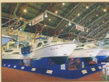
The Broom Stand at Earls Court 2003.

Now the challenge is on to make a success of the London Boat Show at its new venue in Excel, the brand new exhibition complex in London's Docklands. Brooms have their largest stand yet in a prime position in the centre of the powerboat section in the South Hall.