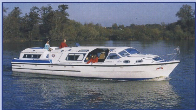
'Commodore Bridgemaster' a five star boat

Brooms have long prided themselves on the quality of their Broads Hire Fleet, but for 2004 this is taken a stage further with all the fleet now graded by the English Tourism Council. Each boat is inspected annually by an independent Council inspector.