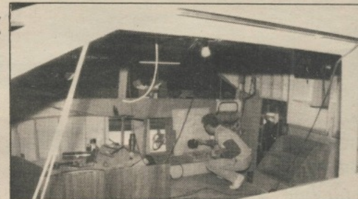
Fitting the luxurious interior of the Broom 44.

A truly international company, Broom export more than 50% of their boats with a flourishing market in Germany and Holland. Ideally located on the River Yare at Brundall, the company have direct access to their foreign market via the river to Yarmouth and the