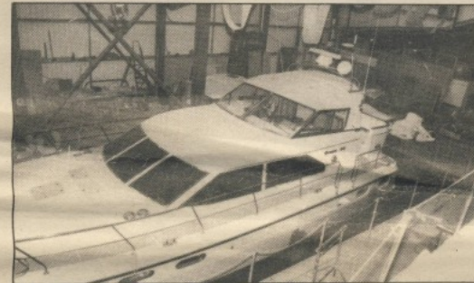
A boat nears completion afloat in the dock.

North Sea. This cuts down delivery time and costs and provides easy access for customers who make use of the company's after sales servicing and refurbishments. The Broom 44, as a top of the range serious cruising boat, combines all the experience and knowledge acquired by the company during the past three generations. The hull form is faster, stronger