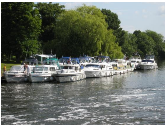
Exhibit 1: To the Top of the Thames 2009