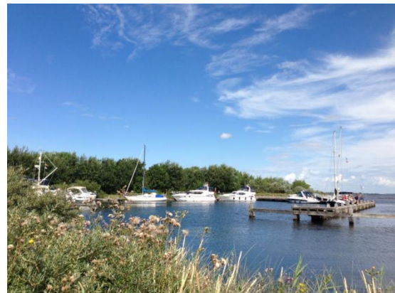
Exhibit 4: France 2014

With our son and family living in the Netherlands and expecting our second grandchild, we were keen to spend an extended period on 'the Continent' to welcome the new arrival. Vic and Maureen on 'Kymata' were also interested so we offered to show them around. We took fellow BOC members Len and Claire Oram ('South Cape') across with us to provide extra eyes on Kymata and crew for the sea crossing on 'Resolution'.